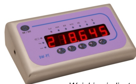
Weighing indicator DW-PT and DW-PT/X

3 formats available: panel, wall and desktop mount