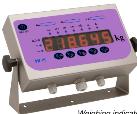
Weighing indicator DW-PT/B