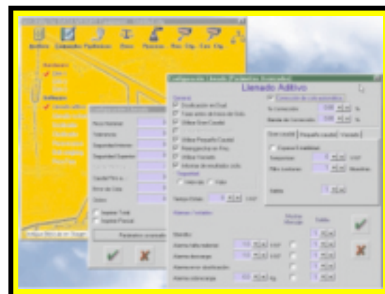
Configuration utility of the weight controller from any PC.